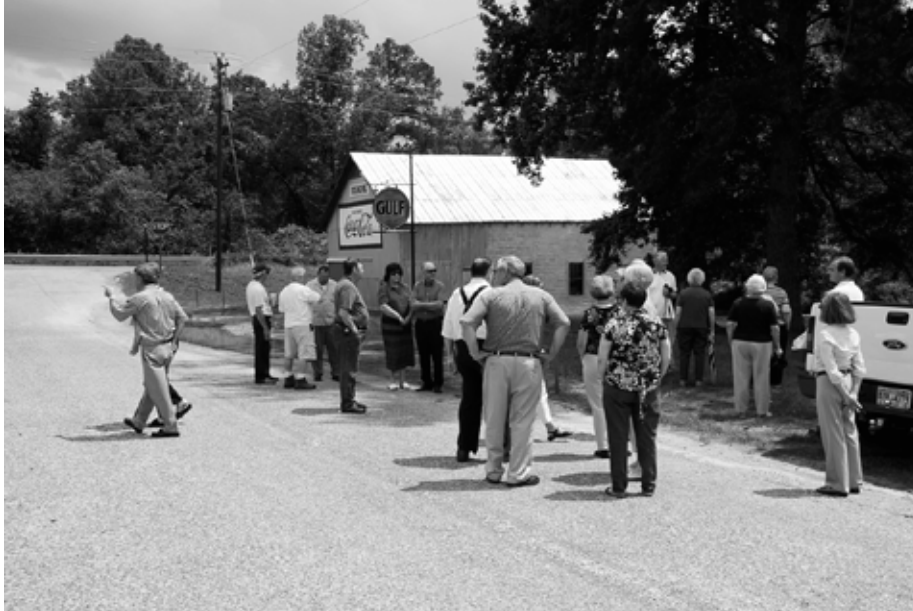
Members of the Taylor County Historical and Geneological Society enjoy a Sunday afternoon gathering to dedicate the new Bartram Trail Historical Marker