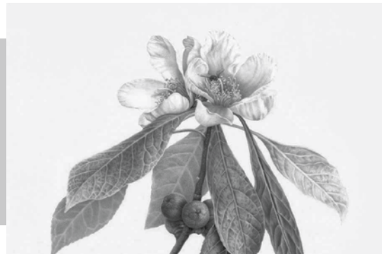
The 1775 historic barn and gallery at Bartram's Garden, the oldest barn in Philadelphia, and Franklinia alatamaha (detail), © Karen Kluglein, watercolor on vellum, 2012