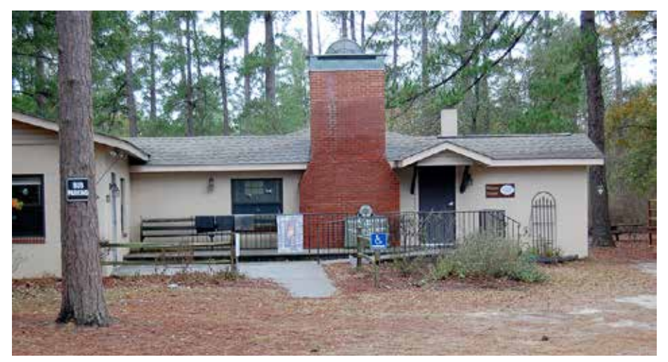
Bartram marker at the Silver Bluff Audubon Center