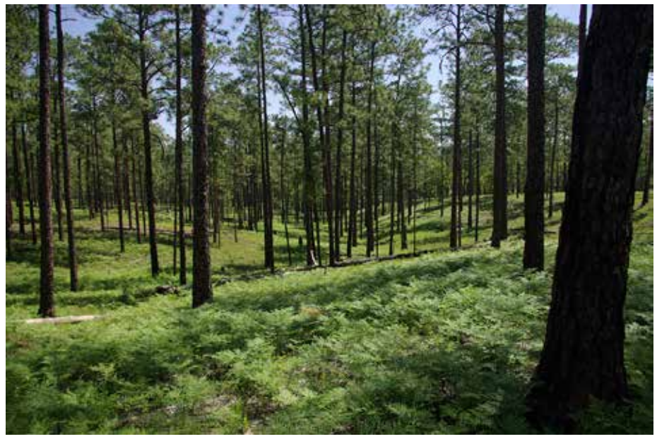
An "airy grove" of longleaf pine on nearby Fort Benning, sustained by frequent low-intensity fire. According to biologists with The Nature Conservancy, this forest structure (with grassland openings) is similar to what Bartram would've seen frequently on his Fall Line journey of 1775.