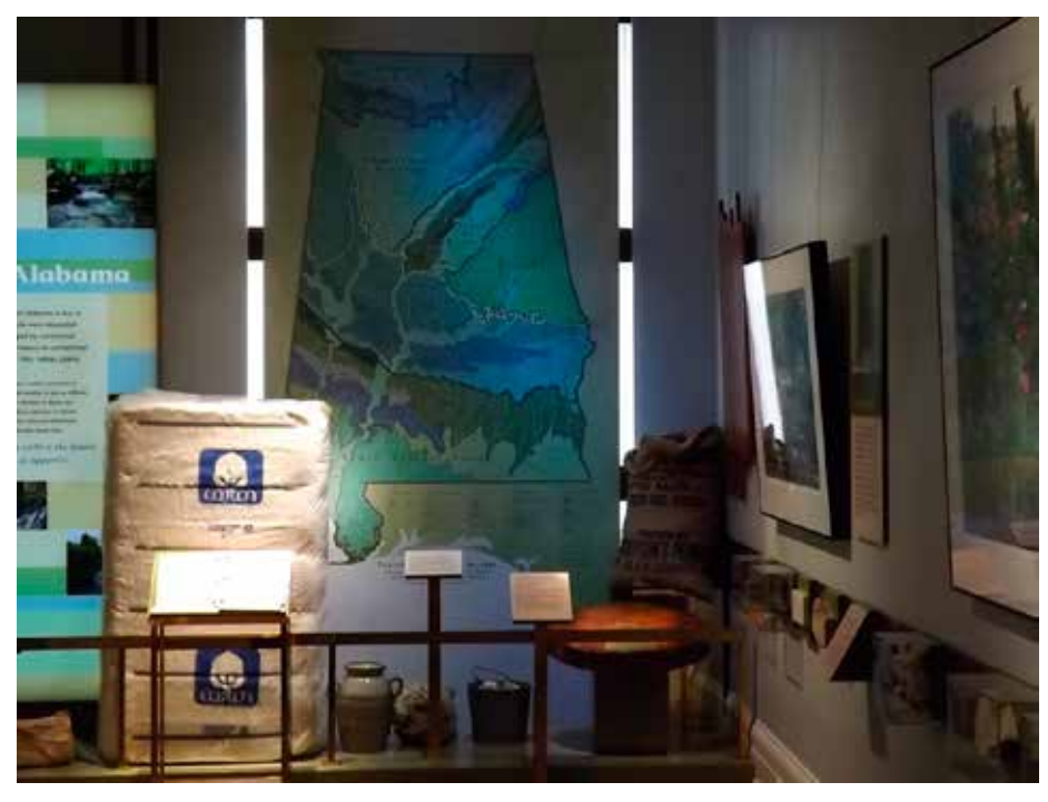
The Land of Alabama Exhibit