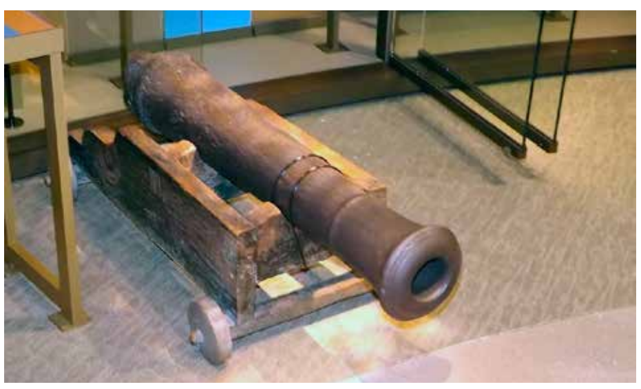
Ordnance abandoned at Fort Toulouse by the French, observed by Bartram

Time rolls on in the exhibit through the American Revolution and then the White influx into Alabama and the associated turmoil between Whites and Creeks, including the Creek War and Indian Removal, and finally, one looks over exhibits depicting events within recent