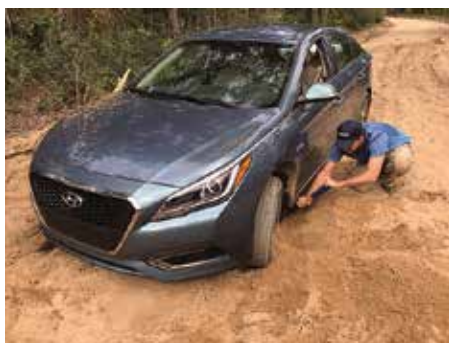
Digging out the car on the Bartram Trail.