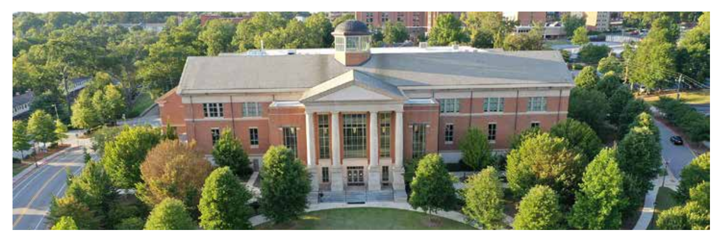
University of Georgia Special Collections Library