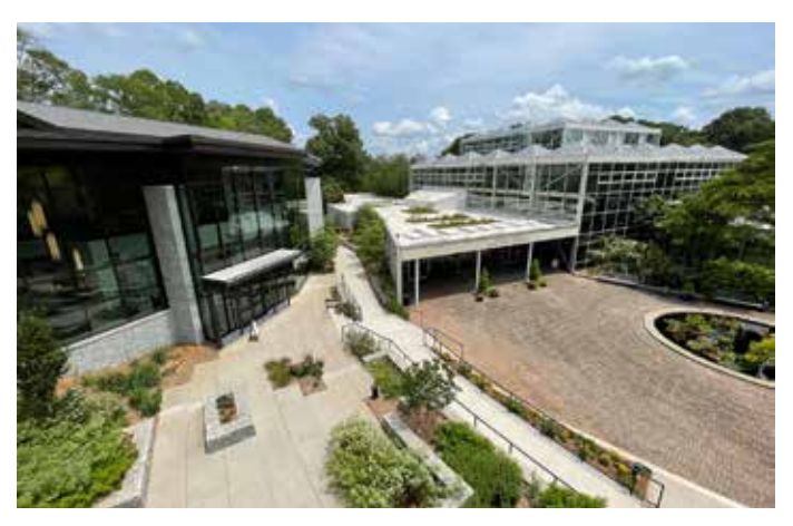
State Botanical Garden of Georgia; Porcelain and Decorative Arts Museum (1) and the Conservatory (r)