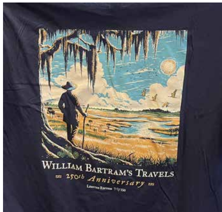
The limited edition commemorative tee shirt for the 250th anniversary celebration was a popular item.